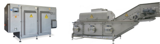
PEF Advantage B 100-535 Capacity: 32 t/h