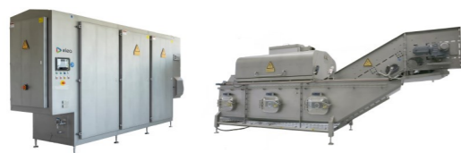
PEF Advantage B 1000-850 Capacity: 90 t/h