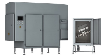
PEF Advantage P 100e Capacity: 26 t/h