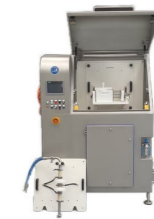
PEFPilot Dual Capacity: 250 l/h (pipe) & 10 l (batch)