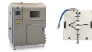
PEFPilot Liquid Capacity: 250 l/h