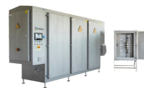
PEF Advantage P 1000i Capacity: 5.000 l/h