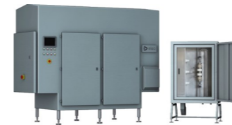
PEF Advantage P 100i Capacity: 2.500 l/h