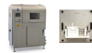
PEFPilot Solid Capacity: 10 l