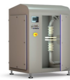
PEF Advantage P 1e Capacity: 11 t/h