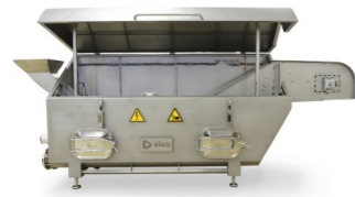
PEF Advantage B 1 & B 1 mini Capacity: 3 t/h (B 1 mini) - 7,5 t/h (B 1)