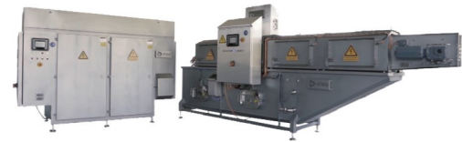
PEF Advantage B 10-320 Capacity: 13 t/h