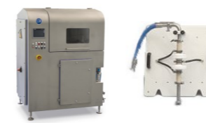
PEF Advantage P 1i Capacity: 500 l/h